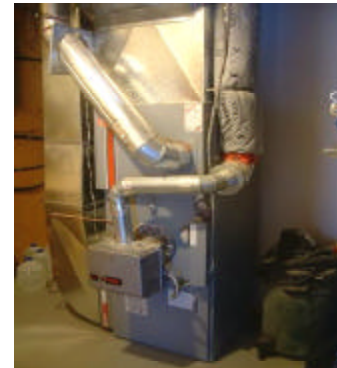
Figure 5: Forced air oil furnace.