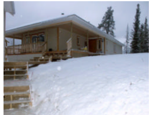
Figure 7: Single storey wood frame house (x986).

The owner's interest in and commitment to renewable energy are prompted by the practical reality of living off-grid, as well as his philosophical conviction "that we are all called to be careful stewards of creation". The base scenario of the annual energy supply is presented in Table 6. The base renewable energy from wind for electricity generation represented only 2.71% of the baseline energy profile, while fuel for space heating represented 87.2% of the baseline energy profile.