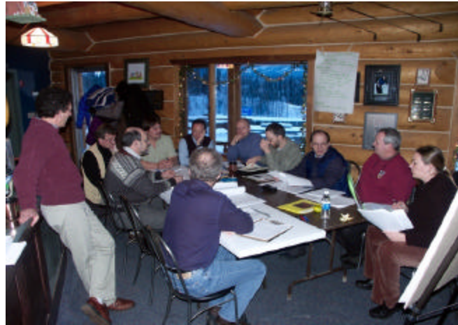
Figure 1. Team discussion at the Yukon off-grid charrette.