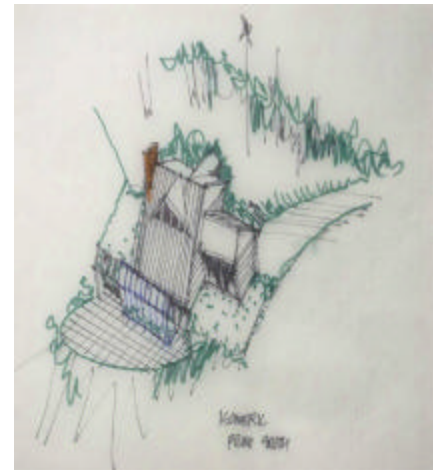
Figure 10: Re-orienting the Long Lake House to maximize solar gain.

The Long Lake team, with the blessing of the homeowner, decided to redesign the house with slightly different design criteria. Instead of creating a modern house which relies solely on renewable energy supply systems, the team developed a more energy-driven house, taking advantage of its location to maximize energy efficiency options and providing an “energy sipping” living space relying on the renewable energy available at the site (Fig. 10). In addition to location considerations these concepts were guided by the design principles established for the Charrette . These measures are factored into the “ideal” energy profile of the house presented in Table 8. In this optimal fresh start scenario, taking into consideration the suggested energy efficiency and site planning improvements below, the total annual energy consumption of the house is reduced by 25% and where the renewable energy content is estimated at slightly below 95% of the annual total at the same approximate cost of $22,000. The remaining 5% of the energy is attributed to back-up diesel power generation and propane fired hot water heaters.