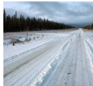
Figure 8: It costs approximately $250,000 to get grid power to the Long Lake house (homeowners driveway on left).