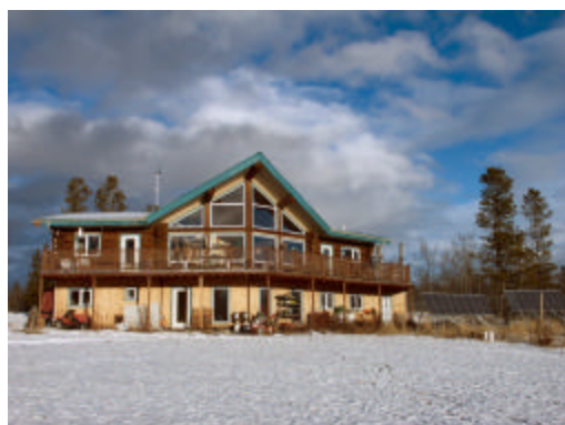
Figure 4: Single storey log house (x987).

The Takhini house 10 (Fig. 4) is representative of many off-grid houses in the Yukon. It is a 10 to 15 year old log home that has been constructed over an extended period of time as permitted by resources. The current owner is interested in updating its renewable energy systems and making the home more energy efficient. The baseline scenario for the Takhini house is presented in Table 4. The base scenario includes 4.67% renewable energy sources from PV and wind electricity generation. While the log walls are a primary source of heat loss from the building envelope they are aesthetically very appealing and the owner is not interested in building modifications that would compromise their aesthetic value