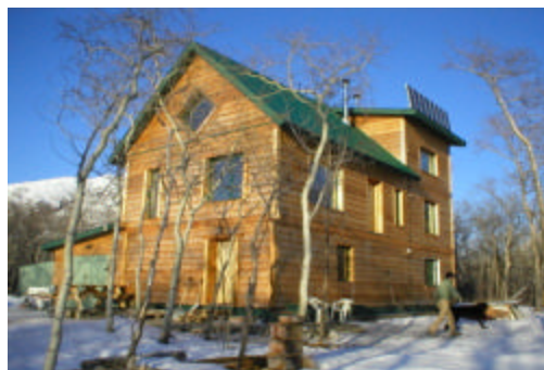
Figure 2: Two -storey post and beam house (x999).

The design is a two-story plus loft timber frame house, rectangular in shape to maximize southerly exposure for passive solar heating. It is an open concept floor plan, which simplifies heating and cooling systems and would be easy to modify to accommodate future lifestyle changes of the homeowners. The house is constructed with locally grown and milled timber. The primary heat source is locally harvested wood burned in masonry Tulikivi Soapstone mass wood heater (Fig.3). The backup heat source is a Rinnai , direct vent propane space heater. The house is equipped with a Bosch instantaneous propane hot water heater. Electricity is primarily generated by an eight-panel 685 Watt PV array. It provides 100% of the load from February through September. A gasoline genset provides back up power and is only required from October through January. Insulation is blown cellulose to R38 in the walls, and R45 in the ceiling. The windows are all hard coat low-e; 1/2” argon filled and are a combination of triple and double-glazed. There are a minimum number of windows on the north side of the house.