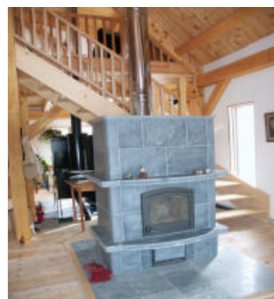
Figure 3: Masonry Tulikivi Soapstone mass wood heater.

This house was the most efficient of the three modelled in design optimization process and was ranked the highest of the 30 houses surveyed in terms of energy consumed per volume of spa (3.0 kBTU/ft 3 ). It uses exclusively the Tulikivi mass wood heater for all space heating requirements.