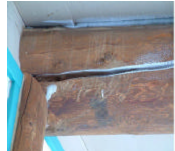
Figure 6: Air leakage of logs, frost build up on interior.

third layer of glazing; install a combined sun shading device and natural light shelf; and, explore the potential of growing seasonal shading plants. Two different heating system options were proposed: replace the existing oil fired furnace and conventional propane hot water tank with a combo system that would consist of a direct-vented oil fired hot water tank and a fan coil unit that would integrate into the existing ducting; and to install a masonry fireplace, which would include a foundation and chimney. Proposed changes to the electrical supply and storage system include increasing the height of the wind turbine, doubling the battery storage supply and installing a PV tracking system.